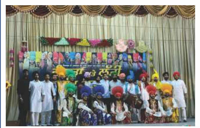
GGDSD College Bhangra team secured 3rd prize in Bhangra-Luddi Cup held at Guru Nanak National College, Doraha on 11 March.