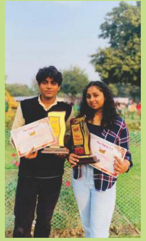
Students of Music Club participated in Antakshari Competition on 19 February at Rose Festival conducted by Municipal Corporation of Chandigarh held at Rose Garden, Sector 16, and won 1st position.

Members of Music Club won 1st position in the Group Singing Competition held at PGGCG-11