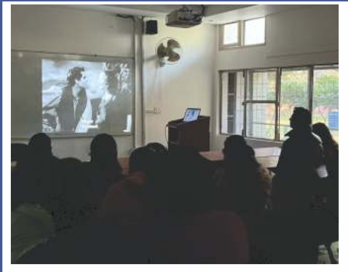
The English Literary Club organized a film screening of Emily Bronte's widely acclaimed work 'Wuthering Heights' on 28 January.