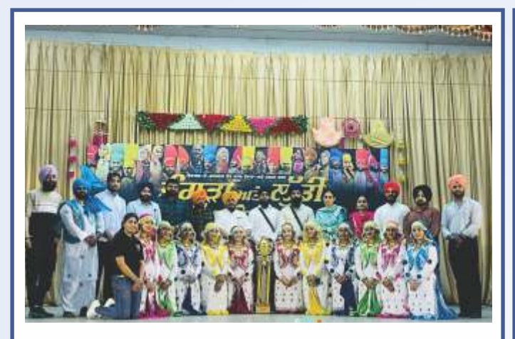
GGDSD College Luddi Team got 1st prize in Luddi-Bhangra Cup held at Guru Nanak National College, Doraha on 11 March.