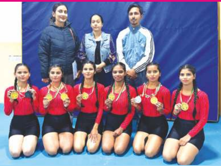
GGD SD College won PU Yoga Women Championship for the 4th time in a row. Tournament was held at PU from 17 to 18 November 2024.