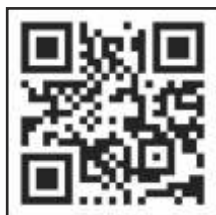
GGDSD ON IRINS