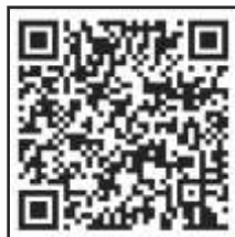
Ask a Librarian Service