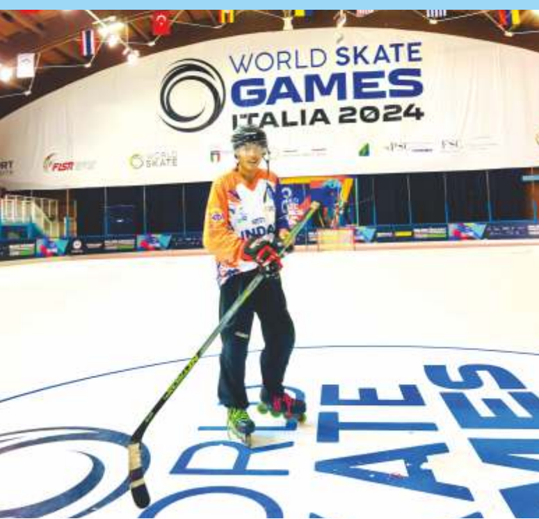
Ayush Sharma, International Skating player, participated in World Skate Games 2024 in Italy.