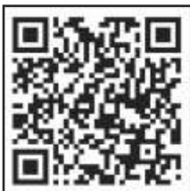
Library Rules & Regulations